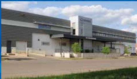
Headquarters in Minneapolis, MN

Innovent® Air Handling Equipment is a manufacturer of custom HVAC equipment used in a wide range of facilities, including schools, hotels, hospitals, pools, manufacturing centers, and commercial buildings. Working with carefully-selected sales representatives, Innovent listens to the needs of designers, installers, and owners to develop custom solutions without the compromises of standard HVAC equipment. Innovent is a business of Unison® Comfort Technologies.