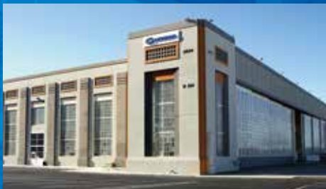
Facility in Sacramento, CA

For more information, contact your local representative or Innovent directly at: